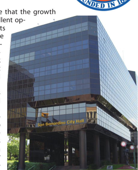
The San Bernardino City Hall

Your new aviation connection to Southern California