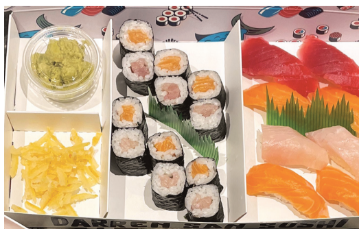
AKT's candied yuzu peel (bottom left) debuted during Super Bowl LVI at SoFi Stadium on Feb. 13.

LEARN ABOUT TUNA FROM NAGASAKI VIA THIS QR CODE