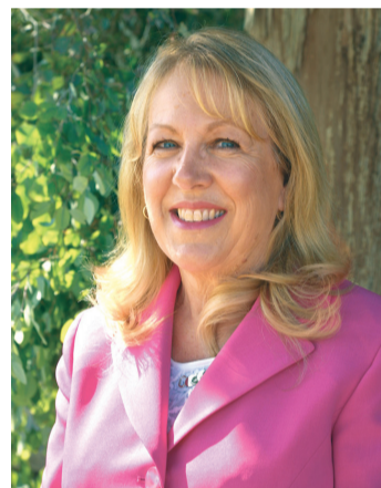
California City Mayor Jeanie O'Laughlin

"I'd like to see some type of manufacturing here. We're very well located. Using Freeway 14, we are only a three-hour drive from Las Vegas Airport. That's less time than what it takes for me to go to LAX. The 14 goes up to Mammoth Lakes and Northern California. We also have Freeway 58, which is a main highway that goes to Bakersfield and also connects to Freeway 5, which goes up north," the mayor explained.